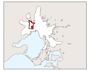
Part of Planning Scheme Maps 9PO & 12PO

Disclaimer This publication may be of assistance to you but the State of Victoria and its employees do not guarantee that the publication is without flaw of any kind or is wholly appropriate for your particular purposes and therefore disclaims all liability for any error, loss or other consequence which may arise from you relying on any information in this publication.